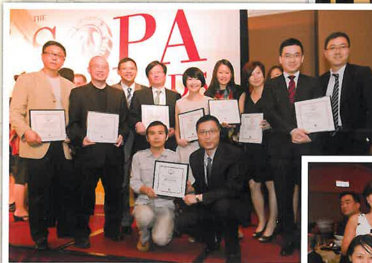
Winners from Yazhou Zhoukan, Ming Pao Daily News and One Media Group