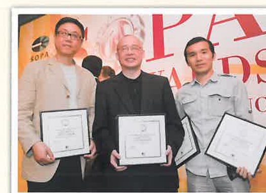
The Yazhou Zhoukan award-winning team