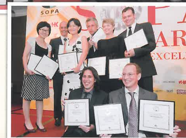
The award-winning South China Morning Post team