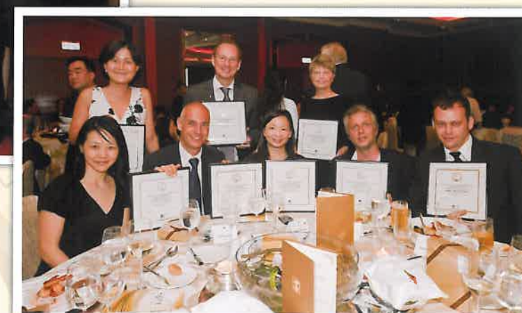
The Triumphant team from South China Morning Post