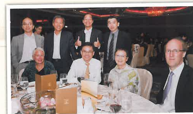
The SOPA Awards' judges table