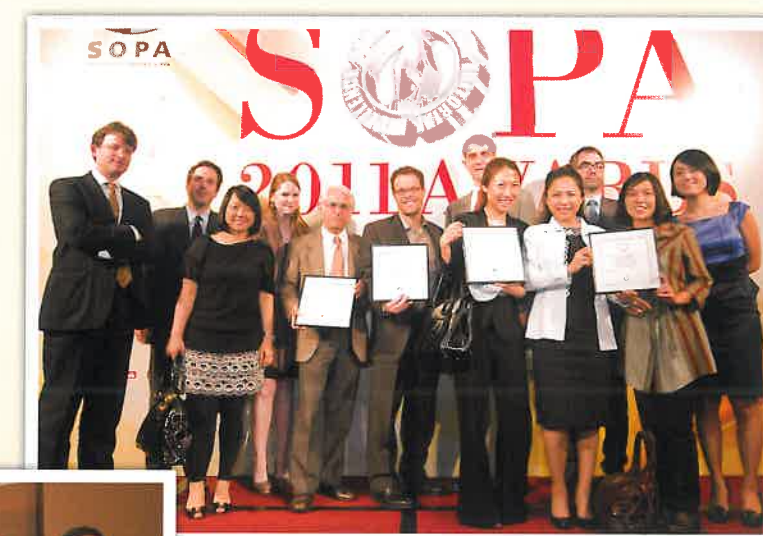
The International Herald Tribune winning team took a group photo on stage with their SOPA Awards