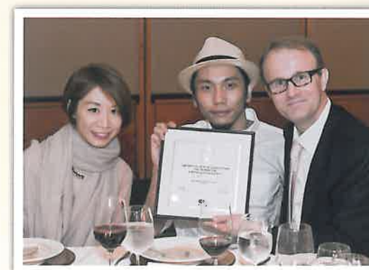
The Modern Media winning team