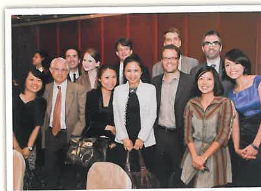
The International Herald Tribune team