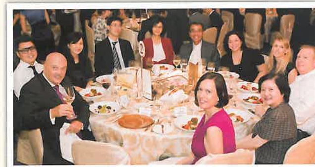
The Invest Hong Kong table