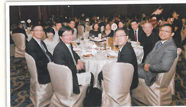
The One Media Group table