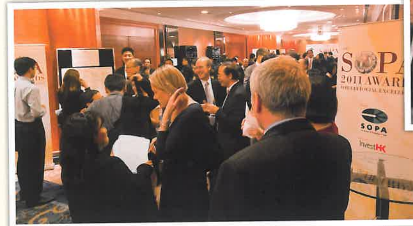
The cocktail reception