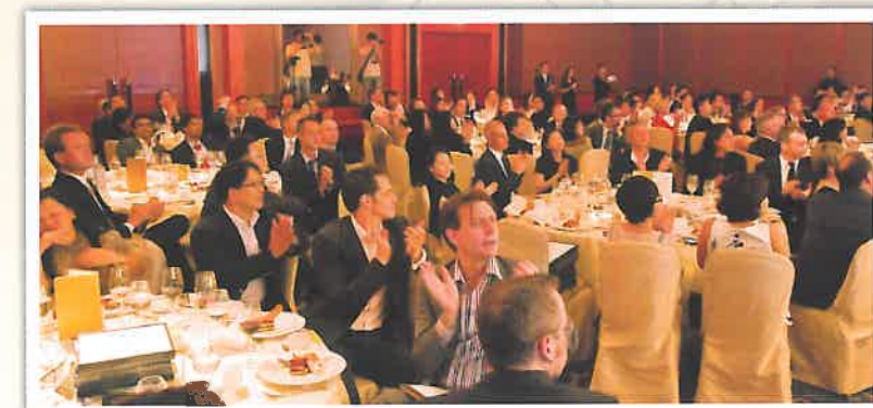
A round of applause from the audience