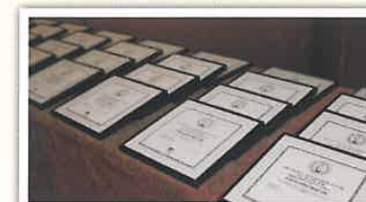
SOPA 2011 Awards for Editorial Excellence