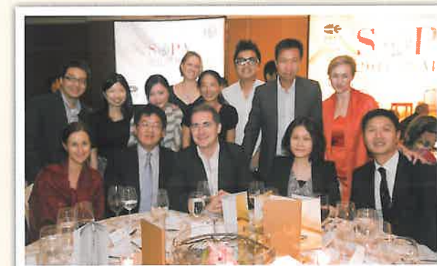
The Bloomberg team