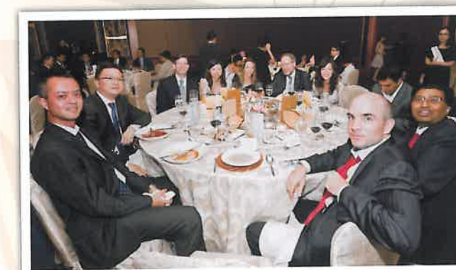
The Thomson Reuters Hong Kong table