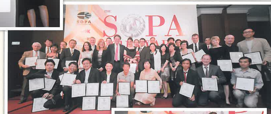
The award winners