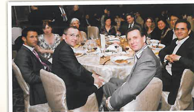
The Financial Times table