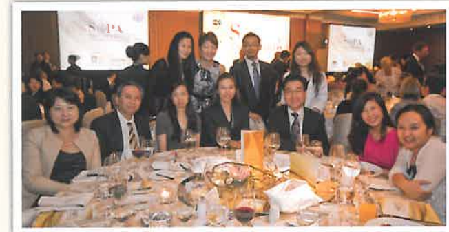
The Newsweek table