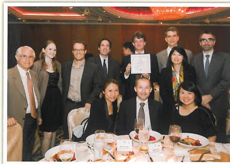
The International Herald Tribune shared their winning moment as a team