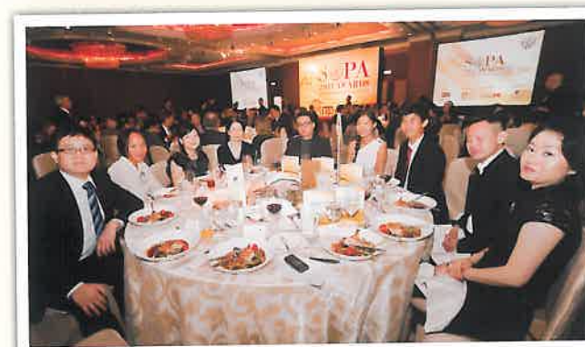
Guests from different publications and companies gathered together for a night of celebration