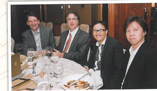
The DestinAsian Media Group team and the Sing Tao News team